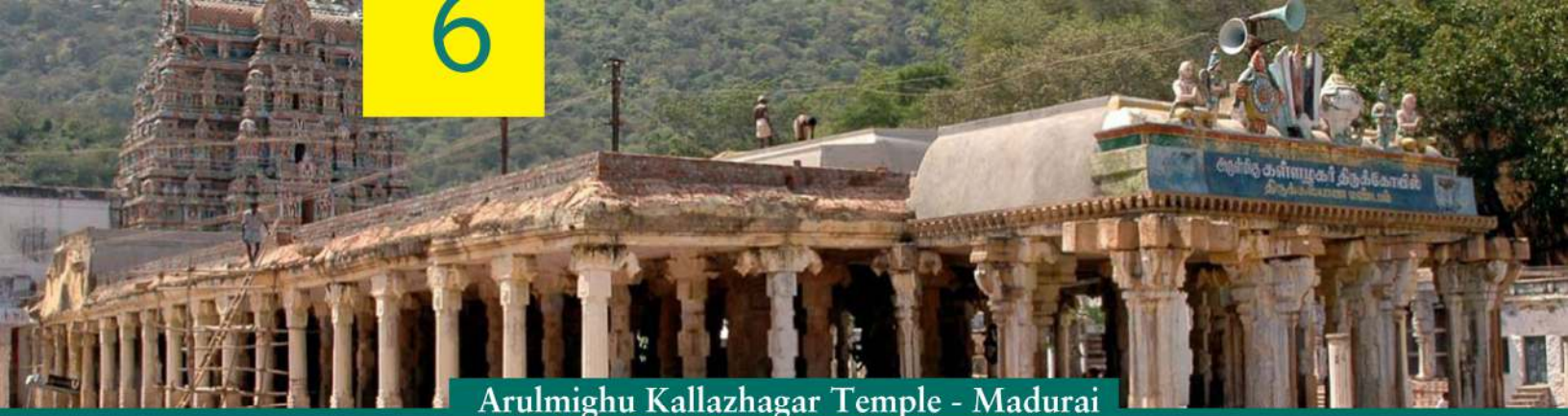
Arulmighu Kallazhagar Temple - Madurai