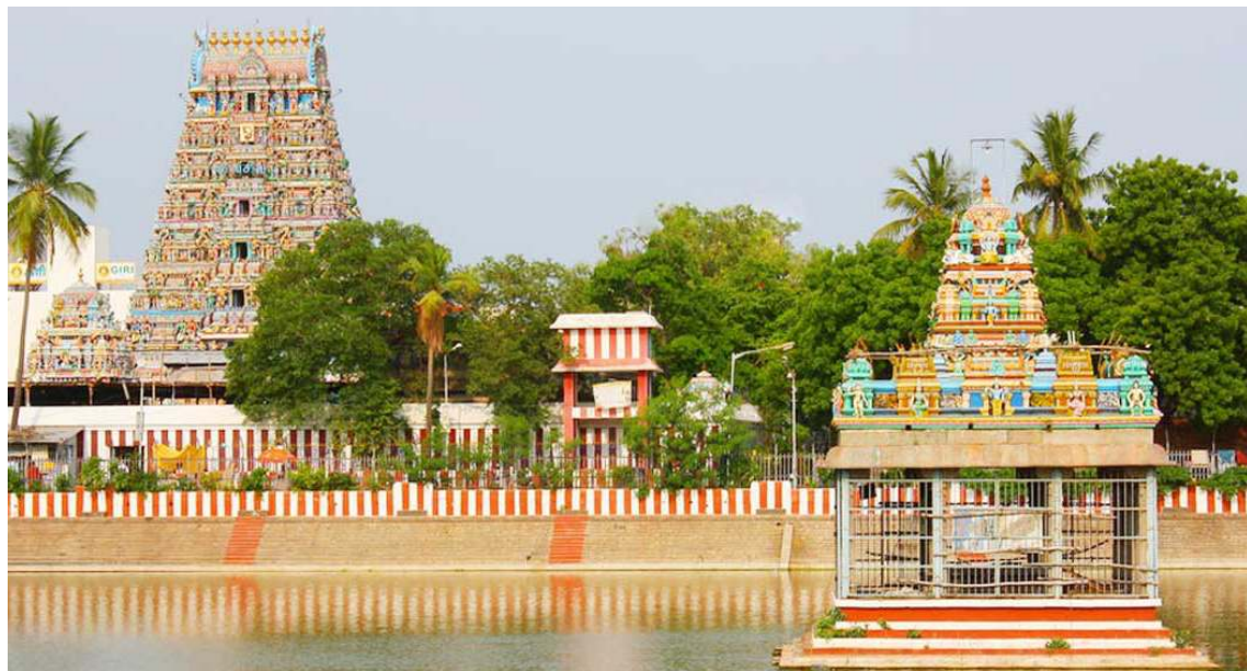
Arulmighu Kapaleswarar Temple, Mylapore - Chennai

The duties and responsibilities of the Engineering team and the documents to be maintained by them is explained in Part-1 of the manual.