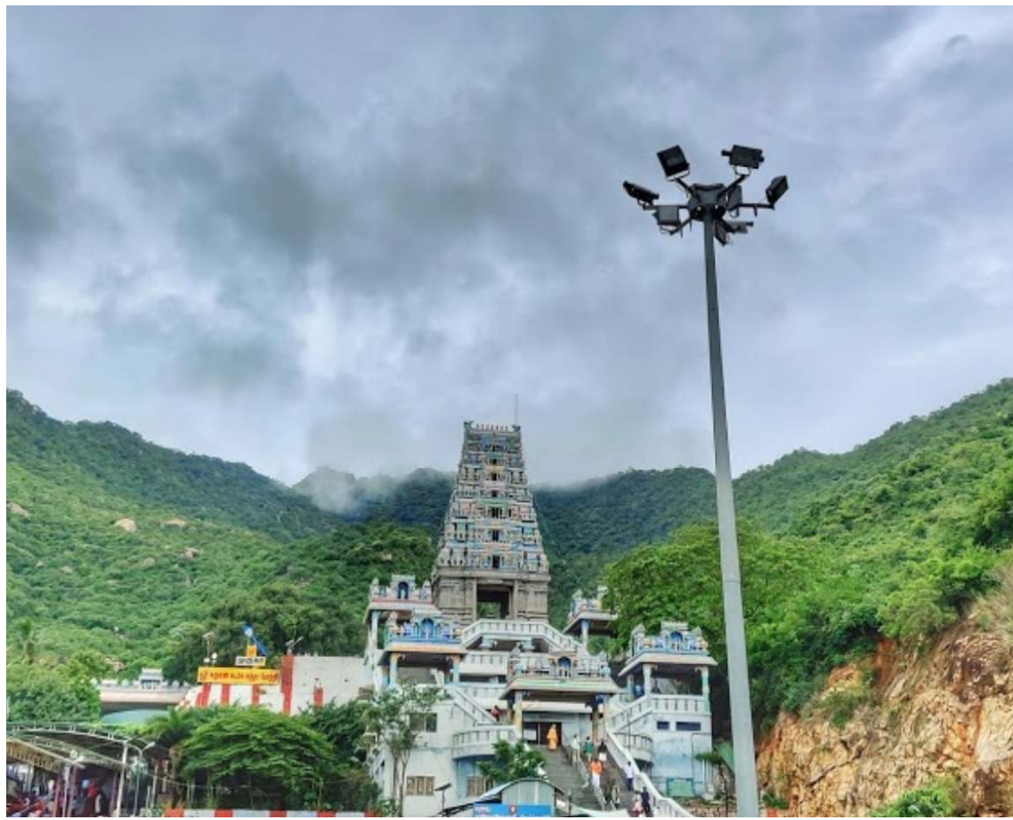
Arulmighu Subramaniya Swamy Temple Marudhamalai - Coimbatore