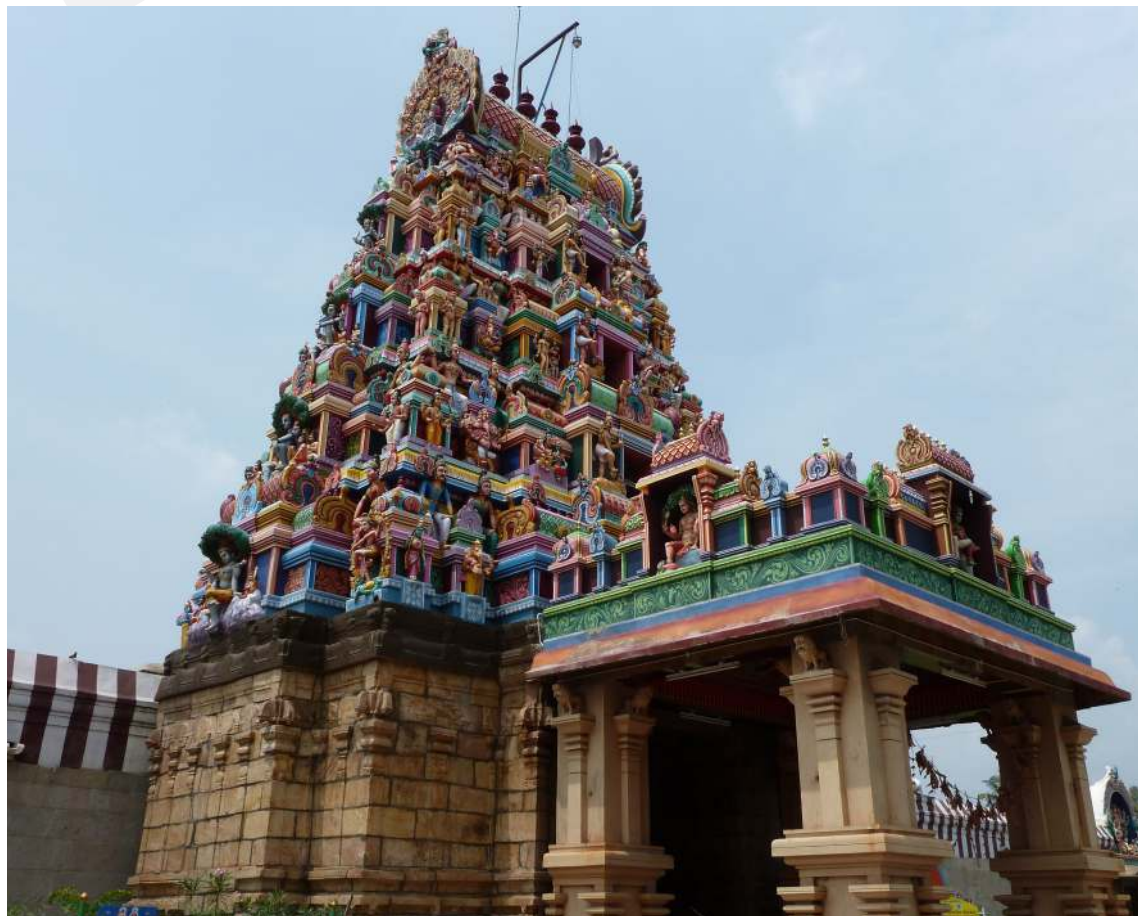
Arulmighu Patteeswarar Swamy Temple Perur - Coimbatore

Consequently the income generated from these properties shall be properly monitored, collected and deposited in the bank. These details shall be subjected to audit by the Finance department as well as the approved external audits.