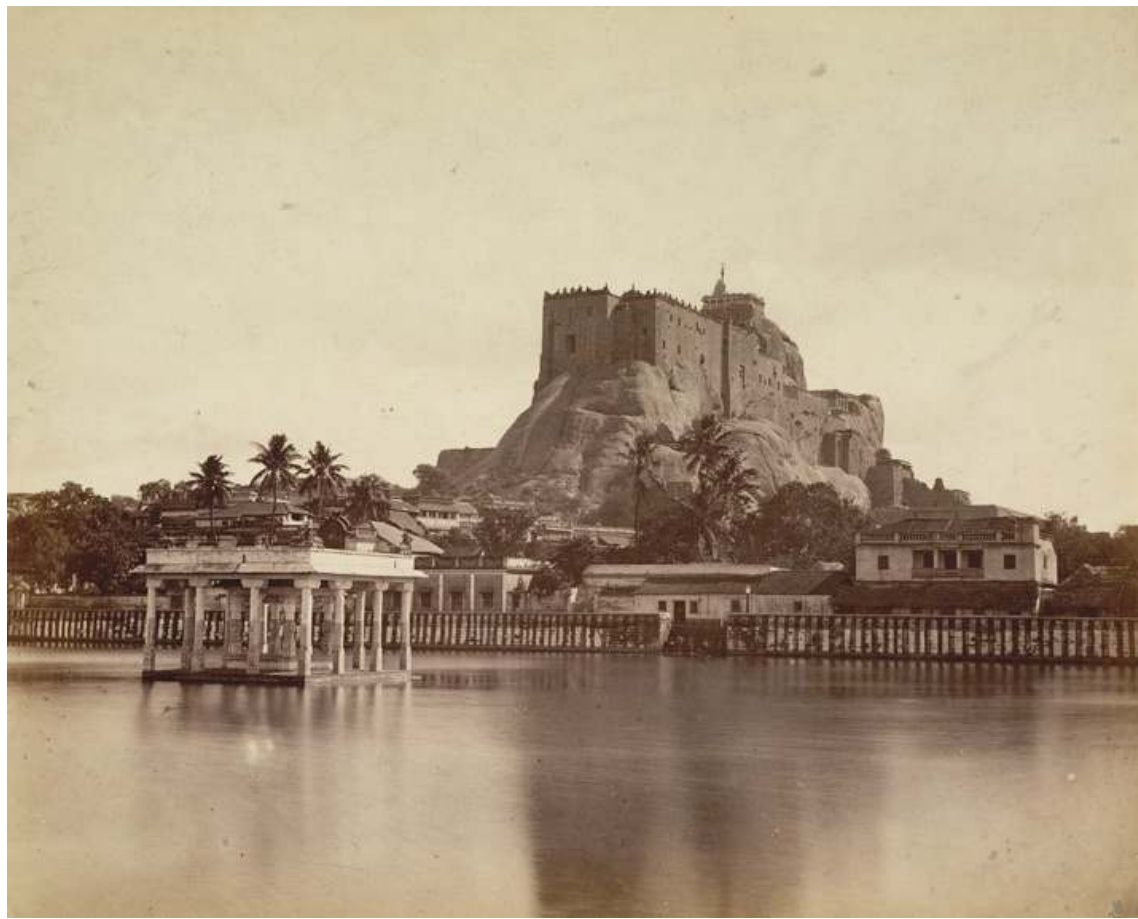
Uchipillayar Temple Malaikottai - Tiruchirappalli