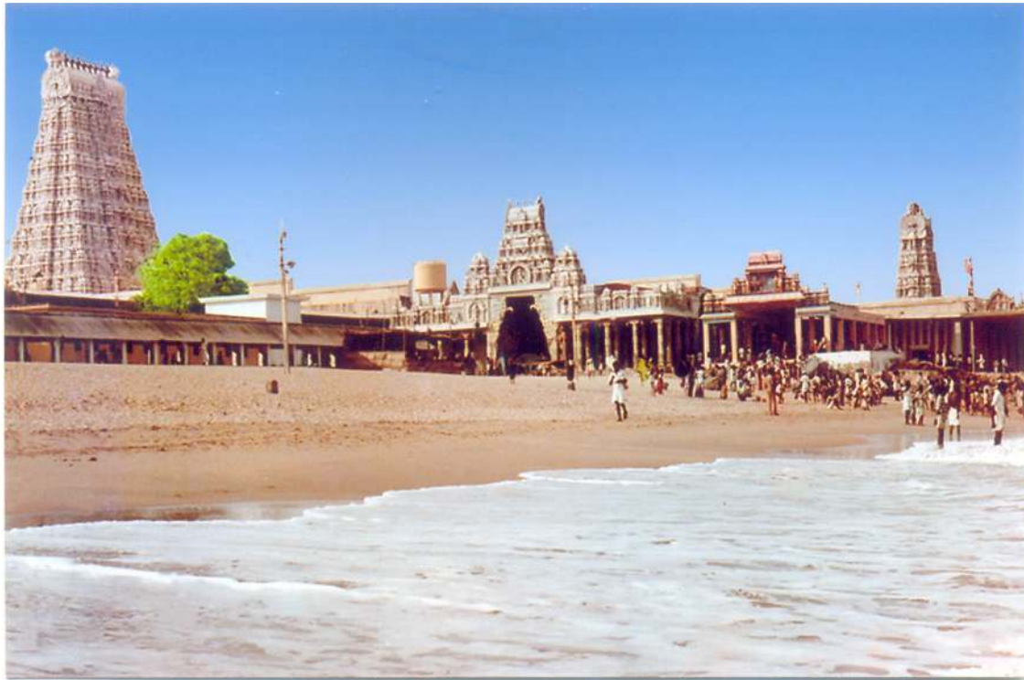
Arulmighu Subramaniya Swamy Temple - Tiruchendur